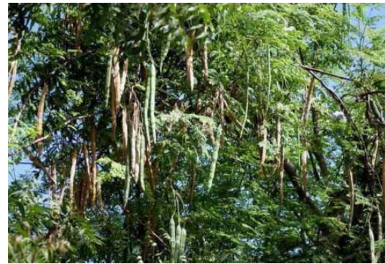
Fig 1 d. Moringa oleifera Tree displaying Mature Pods