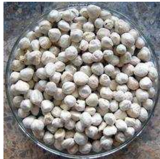
Fig 1e. Moringa seeds without coatings.