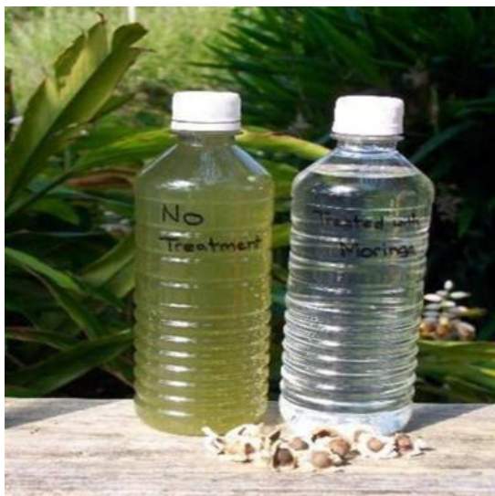
Fig1b. Water Clarity Using Grinded Moringa Oleifera Seeds with Moringa seed powder dirt sinks to the bottom in dirty water.