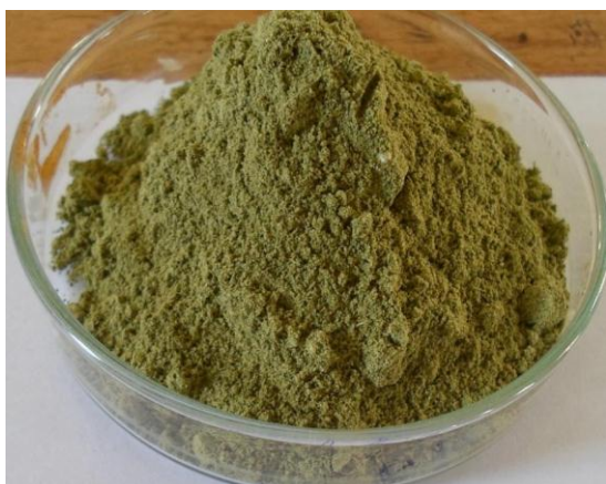
Fig 1 c. Moringa oleifera Leaf Powder